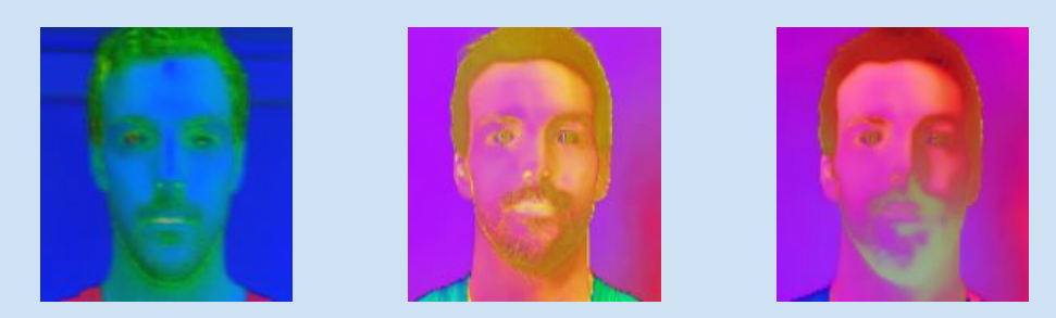
Figure 1: Samples of the different presentations attack instruments, PAI. This database [4] was captured within the framework of collaboration between Idiap and Gradiant.

<sup>J</sup> (a) Real access (b) Print-PAI (c) Screen-PAI